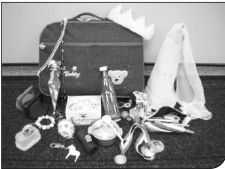
Toys used during the AHA assessment.

The upper limb assessment includes a thorough clinical examination. This will involve us assessing range of motion and muscle strength whilst sitting on a couch. Following this, we will proceed with the appropriate upper limb assessment which will be guided by the referrer and physiotherapist conducting the session.