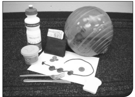
Items used during the SHUEE assessment.