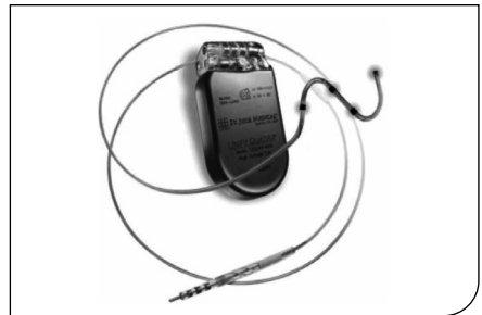
Cardiac Resynchronisation Therapy Defibrillator