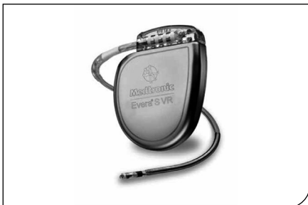
Implantable Cardiac Defibrillator Courtesy of Medtronic, Inc