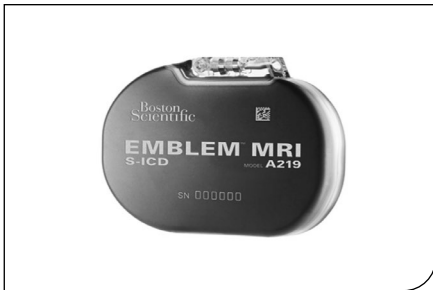
Subcutaneous Implantable cardiac defibrillator. (SICD) courtesy of Boston Scientific.