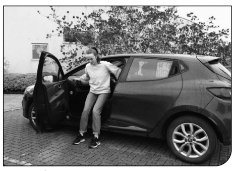
Picture of a patient gently lowering themselves into the seat of car.