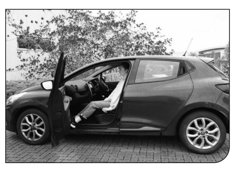
Picture of a patient lifting legs and turning body towards the open car door.

Lift legs and gently turn body towards the open car door.