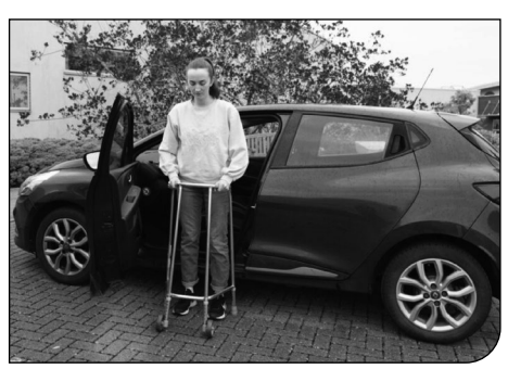
Picture of a patient standing facing away from the car, with a mobility aid.

• Take walking aid and mobilise as able.