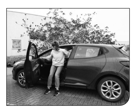
Picture of a patient with one hand on the dashboard and one hand on the car seat preparing to sit.

Place your right hand on a secure place in the car such as the dashboard. Place your left hand on top of the back rest of the seat.