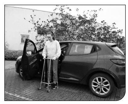
Picture of a patient with mobility aid facing away from car seat with car door open.

Move the passenger seat as far back as possible and slightly recline the back rest. With the passenger door wide open, turn with your walking aid facing away from the car. Keep walking back until you feel the car on the back of your legs.