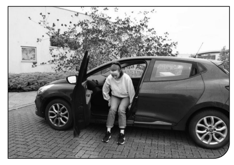
Picture of a patient with both hands on either side of them, shuffling towards the open door until legs touch the ground.

Put both hands on either side of you and shuffle forwards the open door until legs touch the ground.