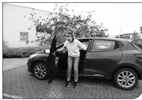
Picture of a patient right hand on dashboard and left hand on back rest of seat, slowly pushing to stand.