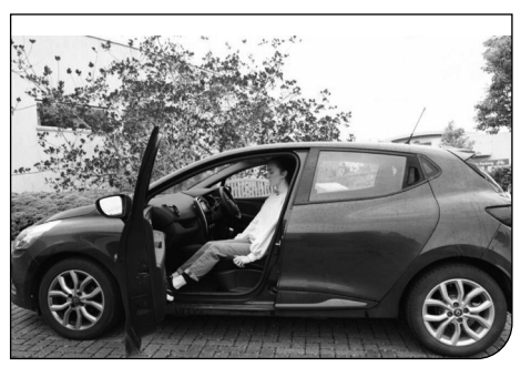
Pictures of a patient placing legs into footwell and readjusting in car seat.